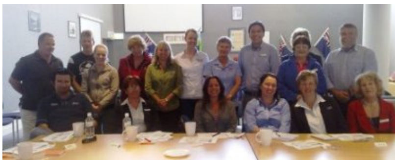
Pictured above - Workshop Participants in Goulburn

Aurora recently conducted Customer Segmentation and Customer Service Workshop in Goulburn, Broken Hill, Taree, Narrabri, Ballina and Casino. Recently 16 AVIC staff from across the Capital Country region attended a workshop and were very pleased with the content and the opportunity to Network and share ideas. Feedback comments such as ... "I found the Workshop very beneficial with many aspects that I had not thought about".... and ...."Thank you, it was very useful and informative - great food for thought". Of course there was special mention on how fantastic the food was too!