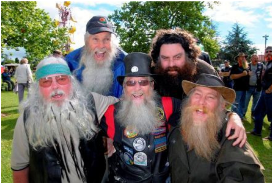
Pictured above - some happy attendees at the 2009 Festival.